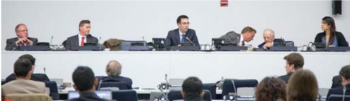
Speakers at the side-event on the crime of aggression on 12 December 2011.

A side-event on the Crime of Aggression, including the book launch of the “Travaux Préparatoires of the Crime of Aggression”, was hosted by the Permanent Mission of Liechtenstein, in collaboration with Cambridge University Press, the Global Institute for the Prevention of Aggression, and Parliamentarians for Global Action (PGA).