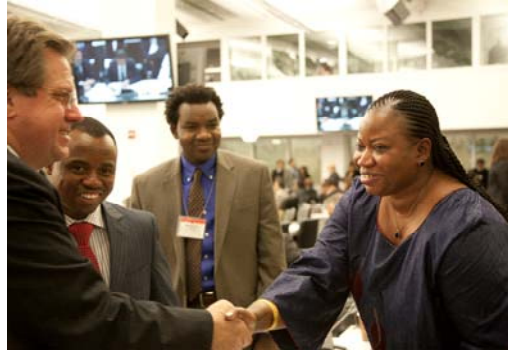
Coalition Convenor William R. Pace congratulates ICC prosecutor-elect Fatou Bensouda during the plenary session on 12 December 2011.

In 2010, the ASP Bureau established a Search Committee for the position of the prosecutor of the ICC. The Search Committee was given a mandate to recommend a minimum of three suitable candidates to the Bureau for consideration. On 25 October 2011, the Search Committee issued a report outlining its efforts to identify suitable candidates. The report commended four individuals for the position. On 1 December 2011, the president of the ASP announced that an informal agreement had been reached to nominate Fatou Bensouda (The Gambia) as the consensus candidate for election as the next prosecutor of the ICC. This announcement followed informal consultations among ICC states parties to identify one candidate for formal nomination and election by consensus during the 10 th ASP session.