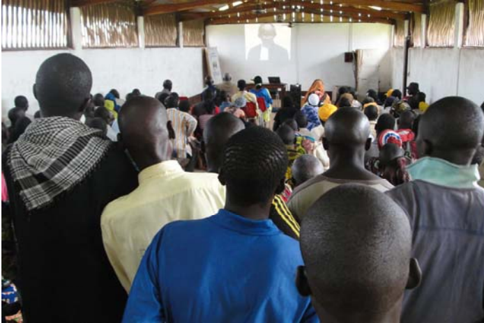
An ICC outreach session was held in Bossemptele, CAR in September 2011 to increase the general understanding by the affected communities regarding the judicial proceedings related to the Bemba case.

The Court's external communications functions include external relations, public information and outreach. These functions are defined in the Court's "Integrated Strategy for External Relations, Public Information and Outreach."