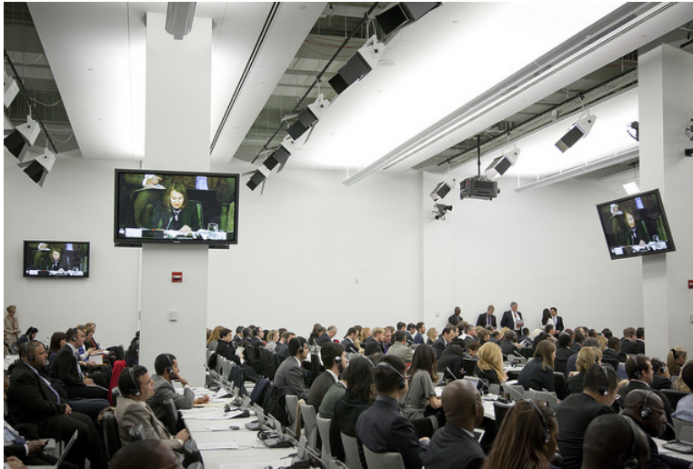
Participants on the opening day of the tenth Assembly of States Parties.

The present report constitutes a summary of the 10 th session of the Assembly of States Parties (ASP) to the Rome Statute of the International Criminal Court (ICC), which took place at United Nations (UN) headquarters in New York on 12-21 December 2011. The Coalition for the International Criminal Court (“the Coalition”) has taken the utmost care to ensure accuracy in the production of this report. Corrections, clarifications or additions should be addressed to communications@coalitionfortheicc.org .