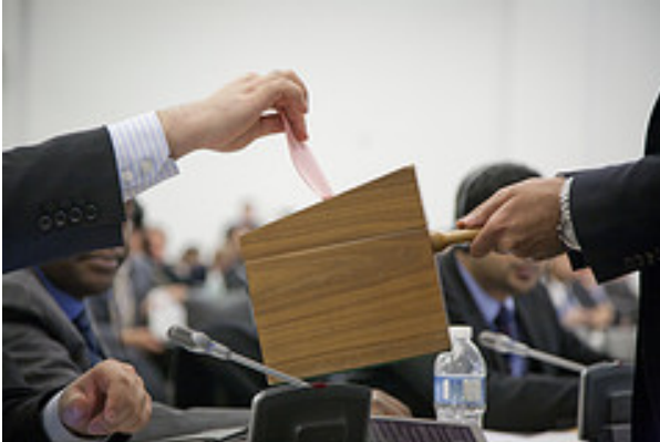
Balloting at the 10th session of the ASP.

to cast a minimum number of votes, as determined by an established formula, for candidates from areas that are underrepresented based on the anticipated composition of the Court. This is to ensure that the composition of the judicial bench is adequately representative in the three MVR areas. The following minimum voting requirements had to be met during these judicial elections: