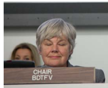
Chair of the Trust Fund for Victims Board of Directors Elizabeth Rehn.