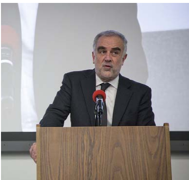
ICC Prosecutor Luis Moreno-Ocampo addresses the assembly during the plenary session.

ICC President Judge Sang-Hyun Song then presented a report on the activities of the Court. Topics highlighted by the president included the growth of the Court in 2011, the busiest year for the Court so far, as well as the need for states parties to come to an outcome in the budget discussions which would reflect a rational balance between the task-driven needs of the Court and the requirements of economy and efficiency.