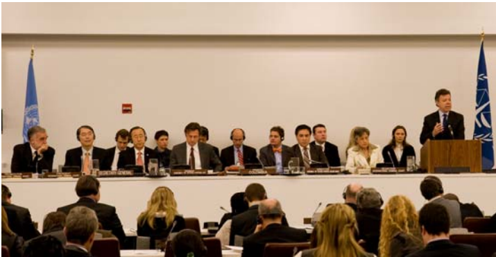
A scene from the 9 th ASP, held in New York on 6-10 December 2011.

At the eighth session of the ASP in November 2009, the Assembly established an Independent Oversight Mechanism (IOM) in accordance with Article 112(4) of the Rome Statute, which was mandated to provide for inspection, evaluation and investigation of the Court in order to enhance the Court's efficiency and economy. In doing so the ASP decided that the independent investigative function would be implemented immediately and the inspection and evaluation functions at a later stage.