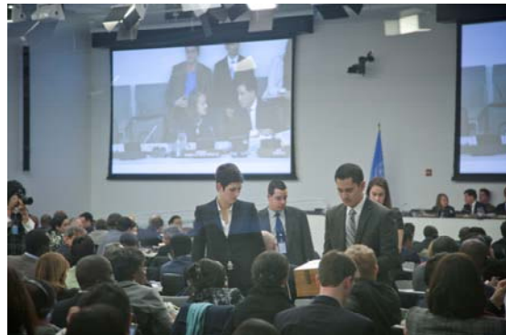
Balloting at the 10 th session of the ASP.